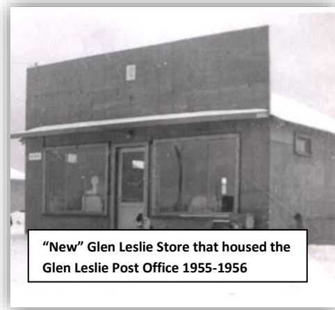
"New" Glen Leslie Store that housed the Glen Leslie Post Office 1955-1956