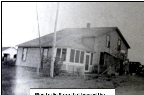
Glen Leslie Store that housed the Glen Leslie Post Office 1922 - 1955