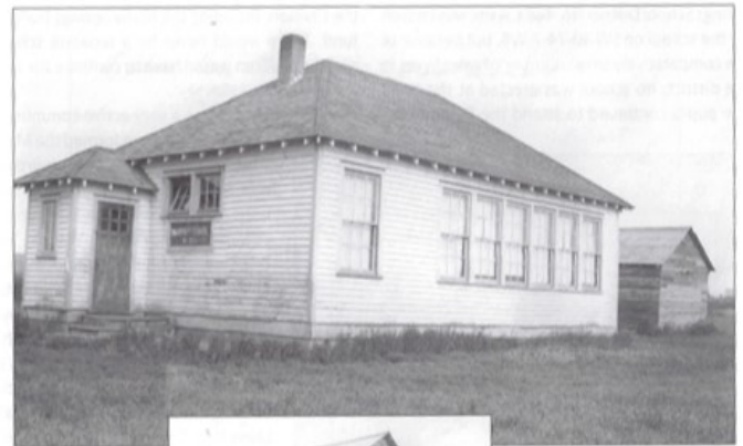
MacHenry School District 2851 was established in 1912 for an area south-west of Sexsmith. The MacHenry School occupied three different sites. It was closed in 1943. GP School Division photos ca. 1952, SPRA 063.02.058.1-3.